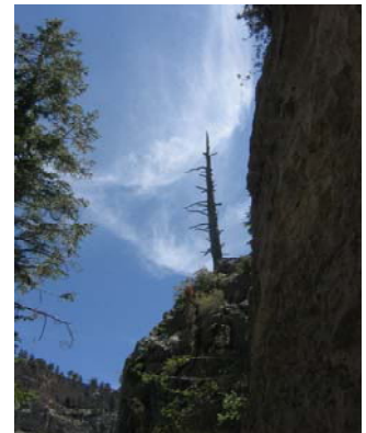
Big Falls Hike in Mt. Charleston, NV

DON'T FORGET TO CHANGE YOUR WATER CLOCK!